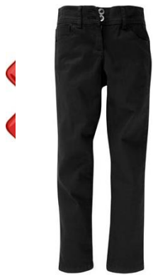
Skinny Jeans style trousers are not suitable