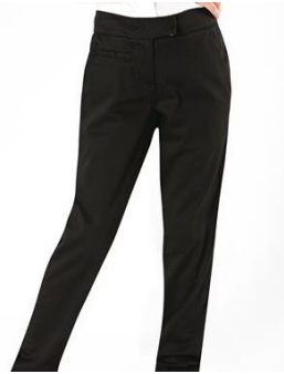
Bootcut or Slim Fit Formal Style are a good choice