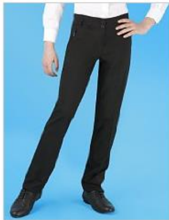
Bootleg or Slim leg are both good choices