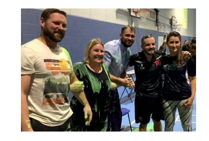
Friday 6th January 2023