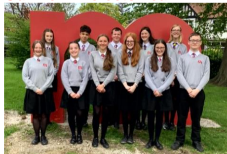
Well done to everyone selected!