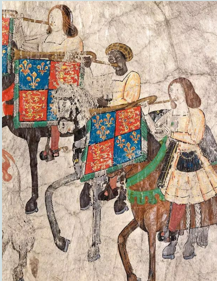
Painting of John Blanke, trumpeter in Henry VIII's court.