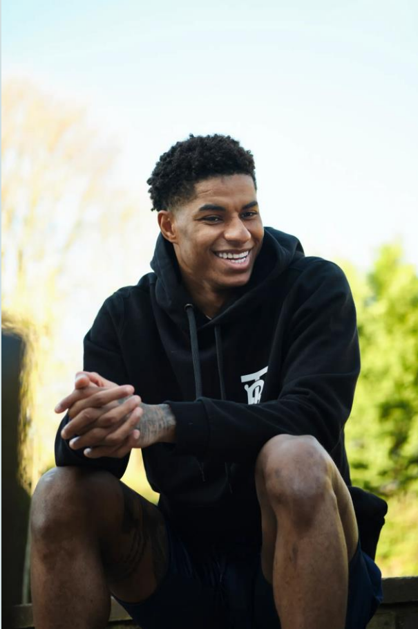
Photograph of Marcus Rashford.