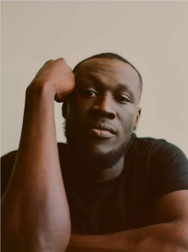
Photograph of Stormzy.