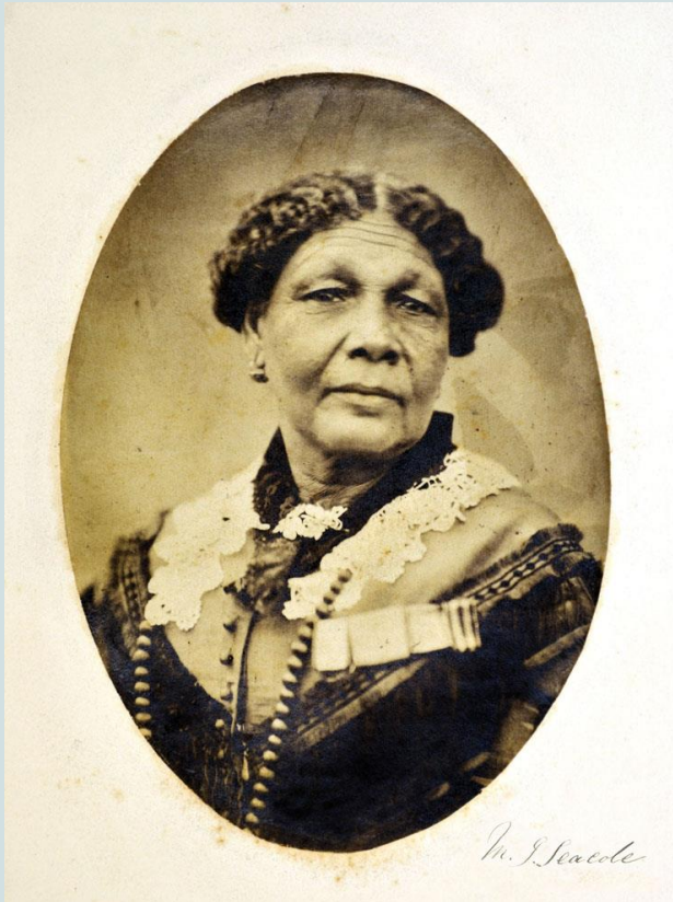
Photograph of Mary Seacole.